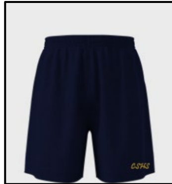
Shorts are to be worn on the waist at the intended length of mid-thigh.

Junior Secondary (Years 7, 8, 9) – Compulsory to be worn the first day of every school week.