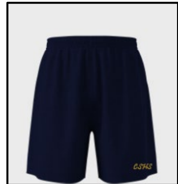
Skirts and shorts are to be worn on the waist at the intended length of mid-thigh.